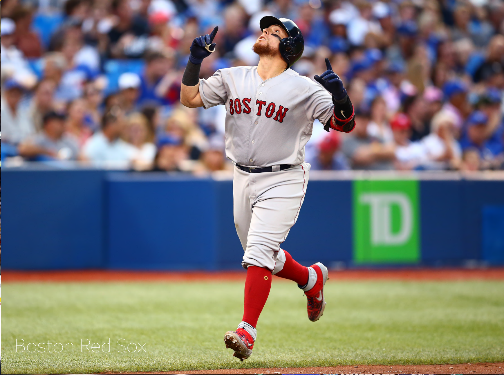
Boston Red Sox